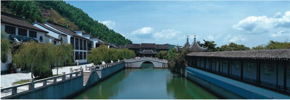
Suzhou Waterfront Street