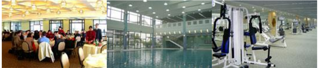
Restaurants, Indoor Swimming Pool, Gym.