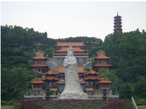
Tian Hou Temple